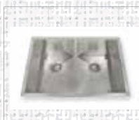
Undermount Sink 1

Here is the standard sink that we offer. Please ask for more options if required.