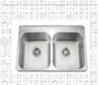
Undermount Sink 2